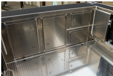
Super Sport O' shore Angler with optional transom storage