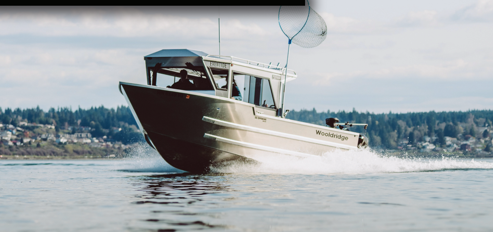
24' Super Sport Offshore Angler