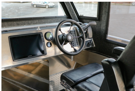
24' Super Sport O' shore Angler shown with optional electronics