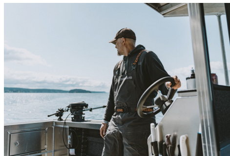
24' Super Sport O' shore Angler shown with options