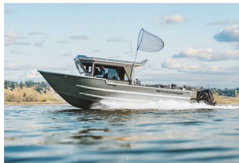
24' Super Sport O' shore Angler