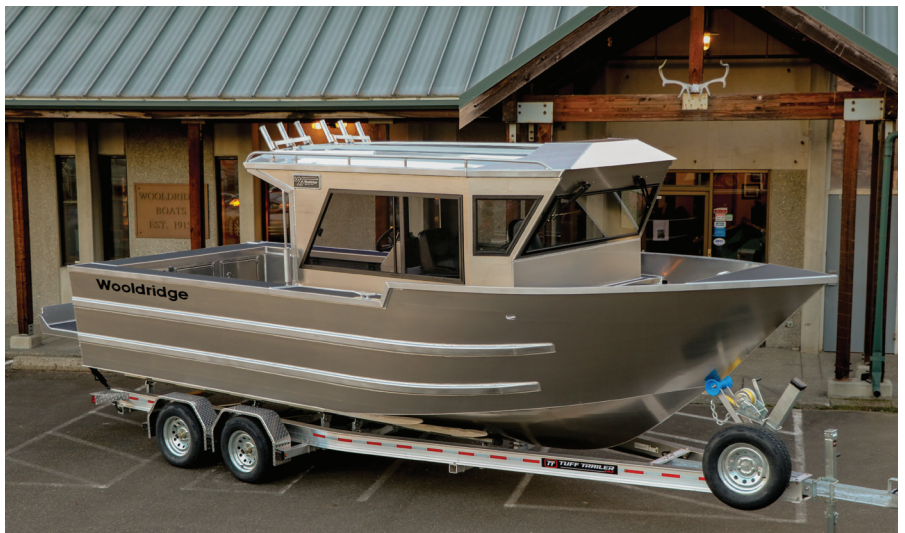
24' Super Sport Offshore Angler