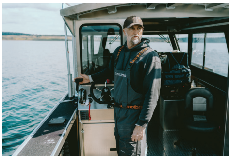
Super Sport O' shore Angler with rear helm option