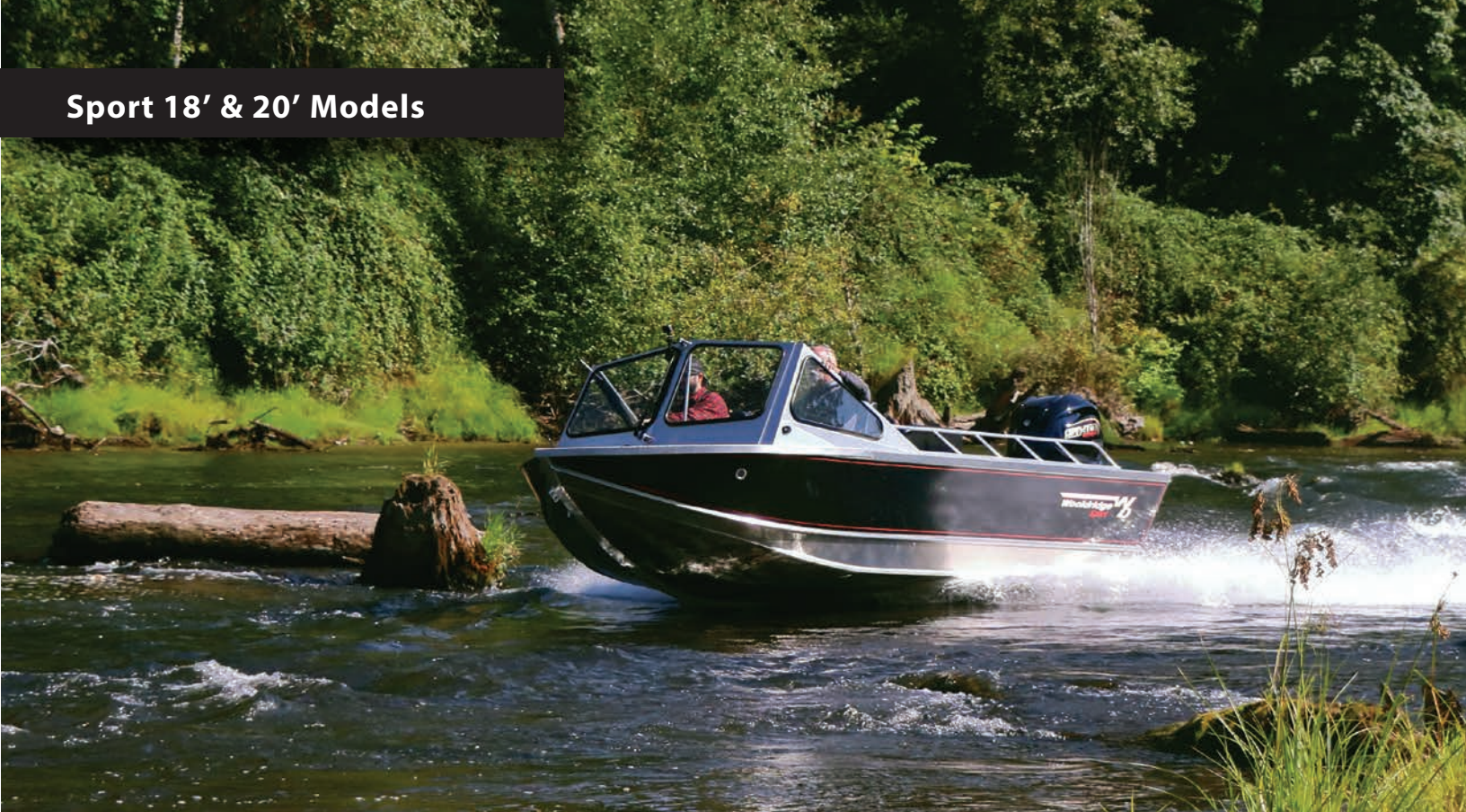
20' Sport Windshield