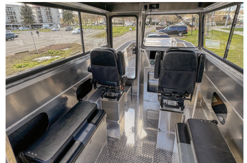
24' LC-1892 Cabin