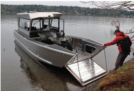
24' LC-1892 Cabin