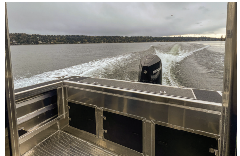
24' LC-1892 Cabin transom storage