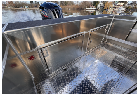
21' LC-1292 T-Top transom storage