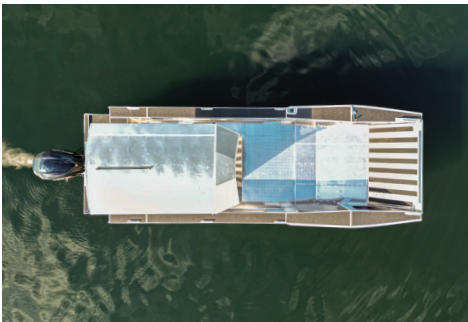
21' LC-1292 T-Top