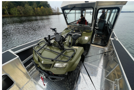
24' LC-1892 Cabin