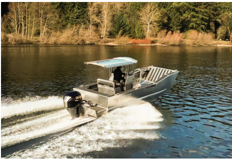
21' LC-1292 T-Top