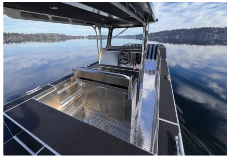
21' LC-1292 T-Top