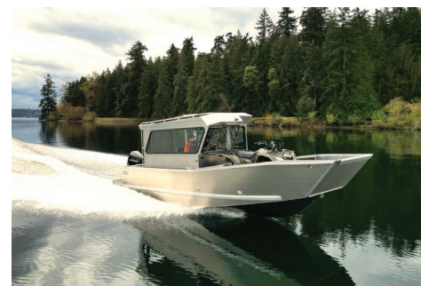
24' LC-1892 Cabin

Whether you're a seasoned adventurer exploring the unknown or a professional in need of a reliable work boat, the Wooldridge Landing Craft is built to take you wherever you need to go, effortlessly. Ready for any job. Ready for any adventure.