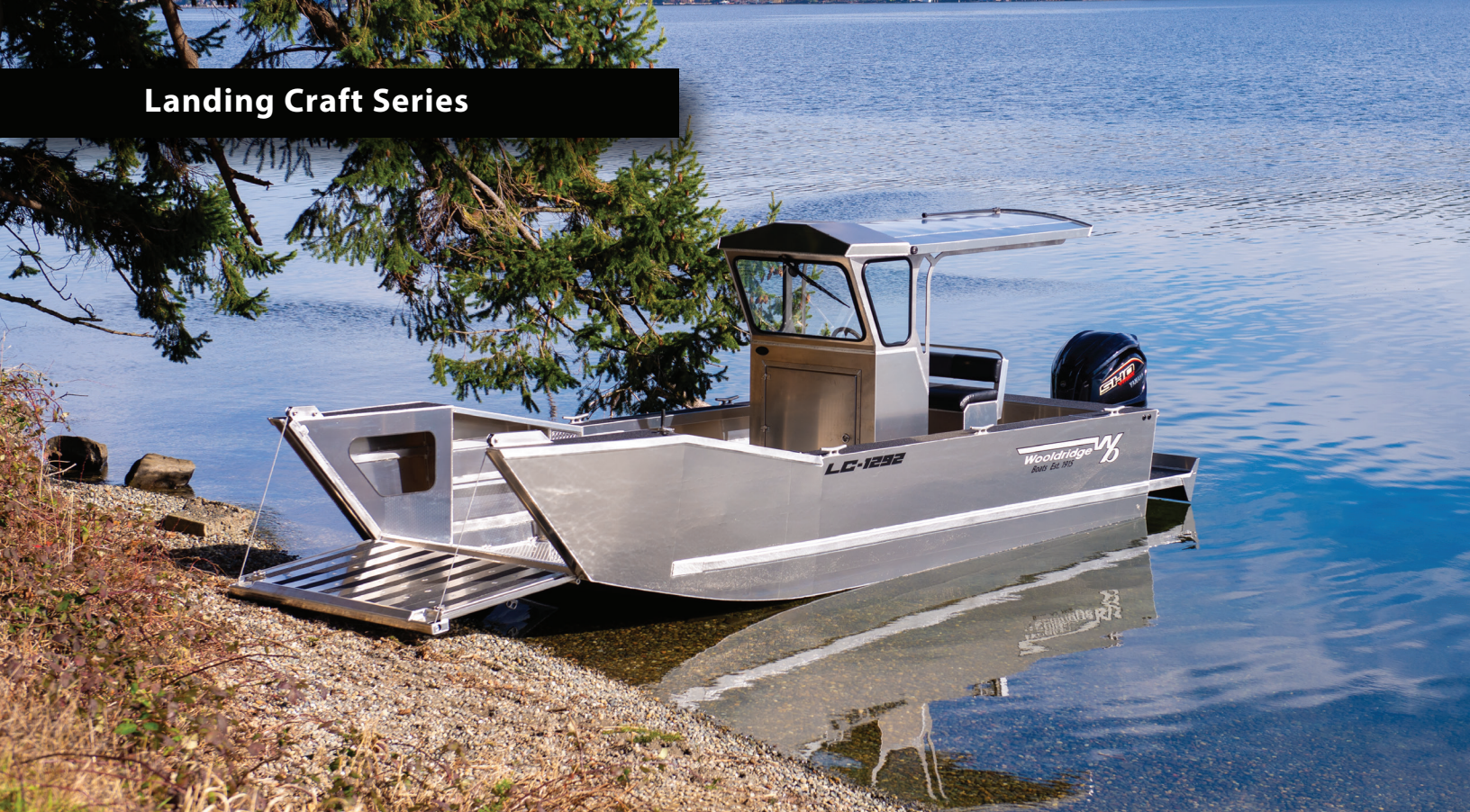
21' LC-1292 T-Top

Introducing the Wooldridge Landing Craft Series – The Ultimate workhorse for adventurers and professionals alike! Engineered for both rugged exploration and demanding tasks, the Wooldridge Landing Craft is the epitome of versatility and durability. Built to handle everything from remote expeditions to heavy-duty work, this boat is designed to excel in the most challenging conditions.