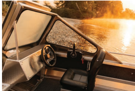
18' Alaskan windshield shown