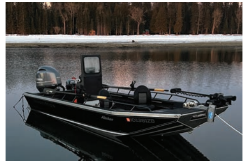
18' Alaskan Center Console shown