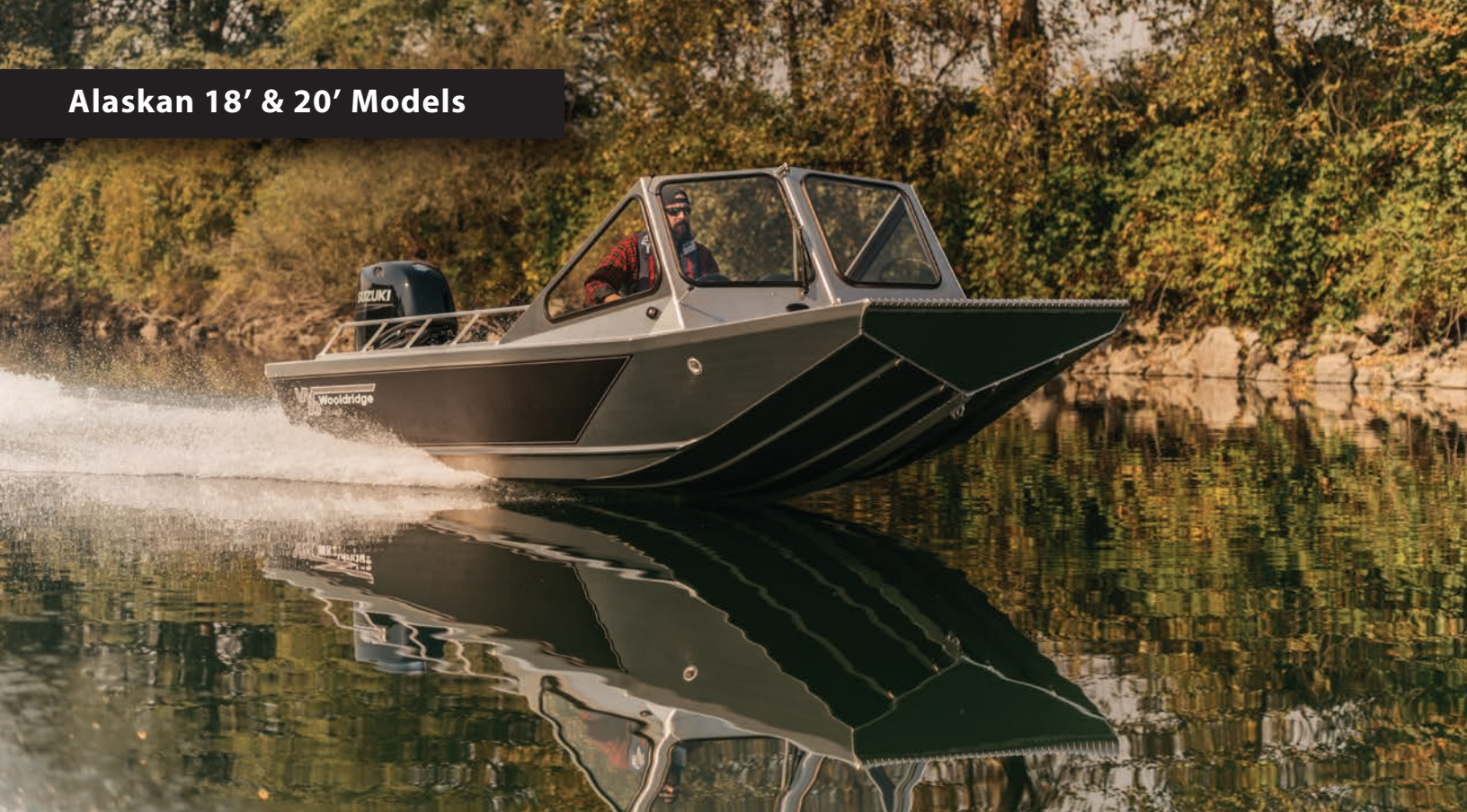
18' Alaskan Windshield shown