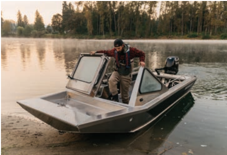
18' Alaskan windshield shown