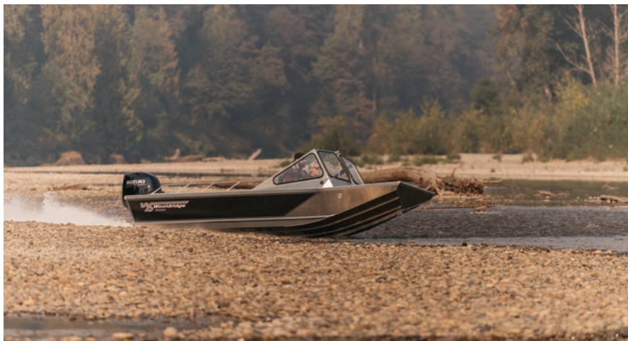
18' Alaskan Windshield shown