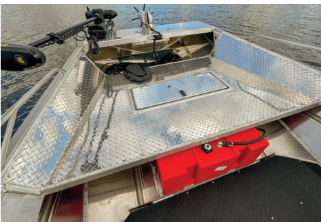
18' Alaskan XL-T shown with single fishbox and other options