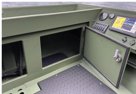
20' Alaskan XL-T shown with optional transom storage