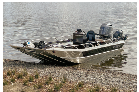
20' Alaskan XL-T shown with VisionX light bar and other options