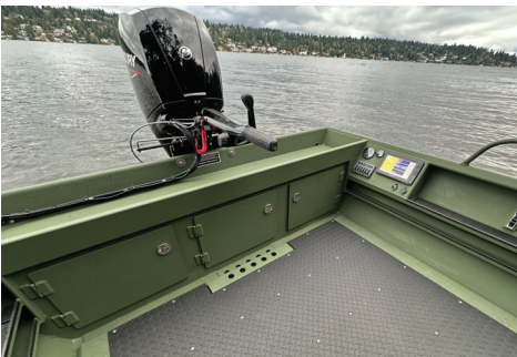
20' Alaskan XL-T shown with optional transom storage