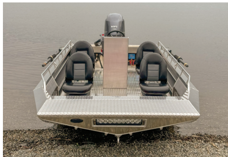
20' Alaskan XL-T Center Console shown with optional seating