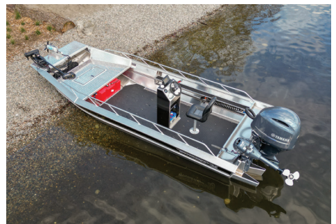
18' Alaskan XL-T shown with options

Wooldridge Boats exclusive jet tunnel offers the best in shallow water running and handling in challenging river running conditions. The tunnel allows the jet foot to be raised for protection, a clean water feed and ram effect. It also provides traction for controlled and predictable performance in tight quarters.