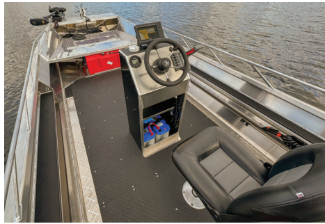
20' Alaskan XL-T Center Console shown with options