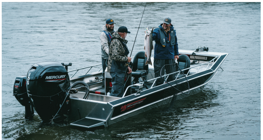
20' Alaskan X-LT shown with options