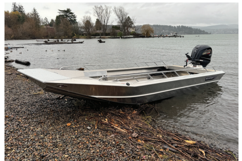
20' Alaskan XL-T