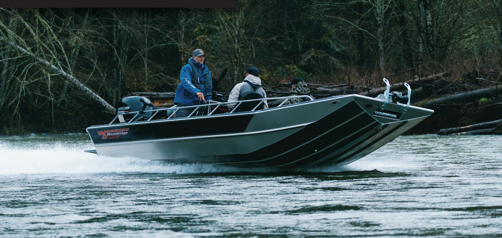
20' Alaskan X-LT shown with options