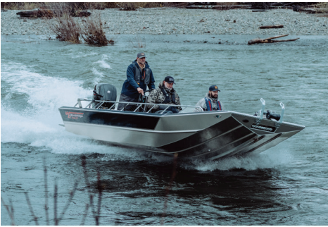
20' Alaskan XL-T shown with options

°Welded bow and stern eyes °Diamond-plate bow cap °Full-length, under-floor cable runs °Recessed diamond-plate step deck