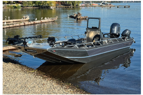
20' Alaskan XL-T Center Console with folding windshield and options