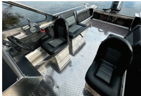
20' Skagit Windshield*