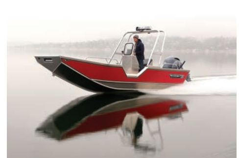
20' Skagit shown with agency options*

*All boats pictured contain optional equipment