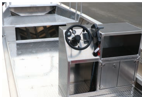
20' Skagit Center Console*