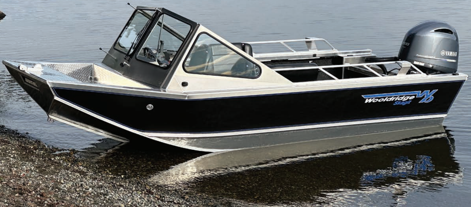
20' Skagit shown with agency options