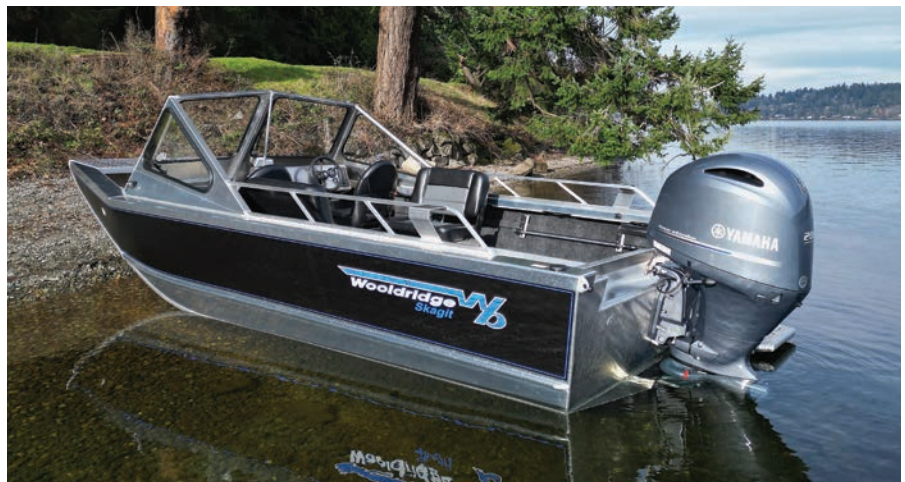
20' Skagit Windshield