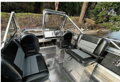
20' Skagit Windshield*