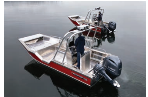
20' and 18' Skagit shown with agency options*