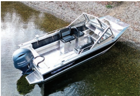
20' Skagit Windshield*