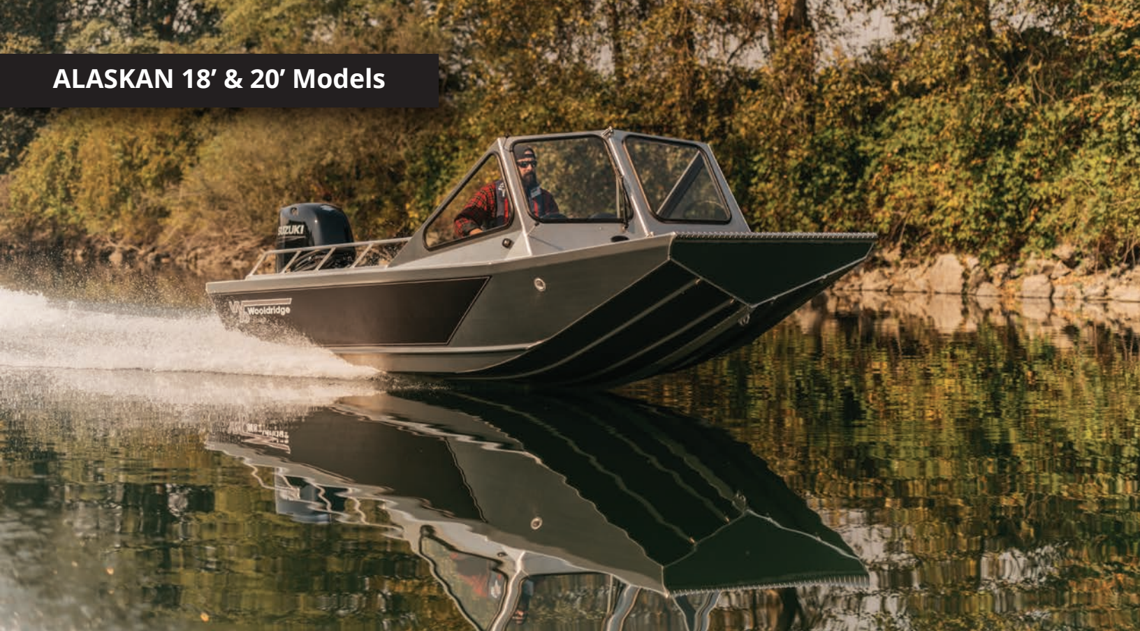
18' Alaskan Windshield shown