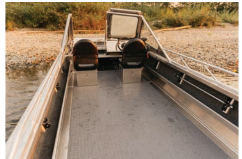
18' Alaskan windshield shown

Wooldridge Boats exclusive jet tunnel offers the best in shallow water running and handling in challenging river running conditions. The tunnel allows the jet foot to be raised for protection, a clean water feed and ram effect. It also provides traction for controlled and predictable performance in tight quarters.