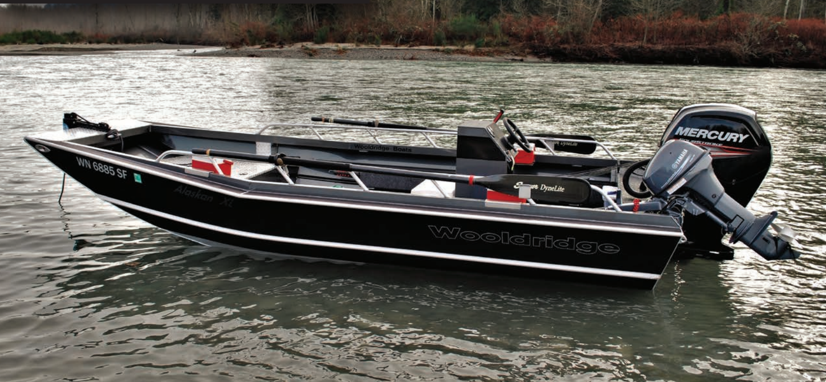
18' Alaskan XL Center Console