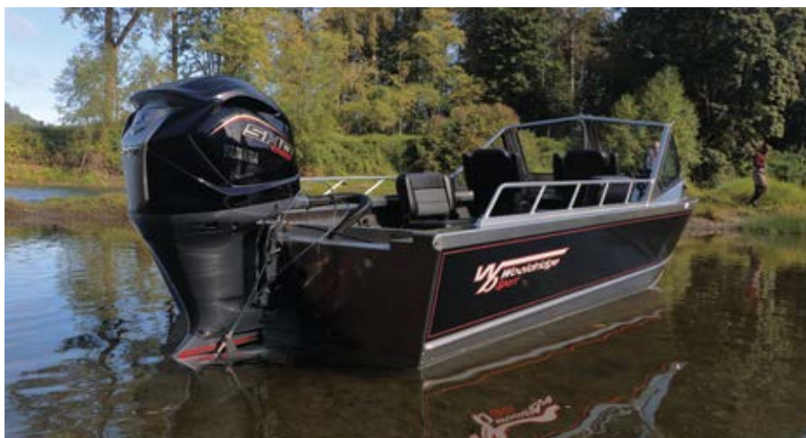
20' Sport Windshield*