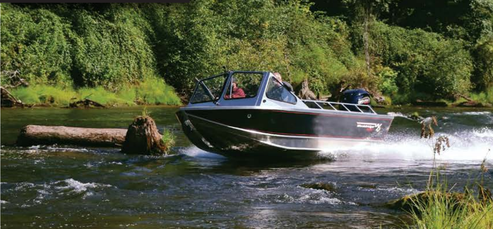
20' Sport Windshield