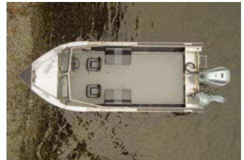
20' Sport Windshield*