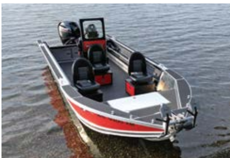
20' Sport Center Console*