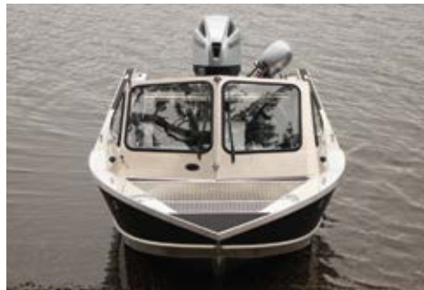
20' Sport Windshield*