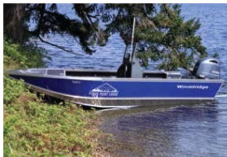
20' Sport Center Console*