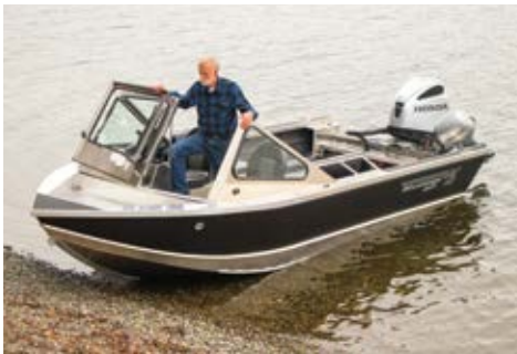
20' Sport Windshield*