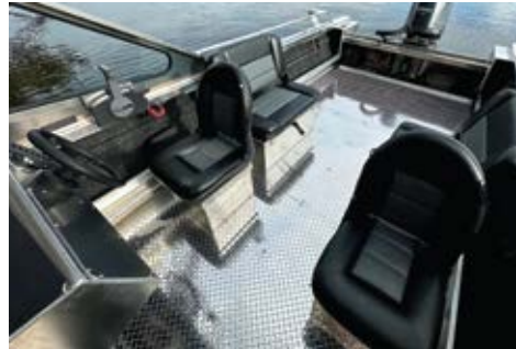
20' Skagit Windshield*