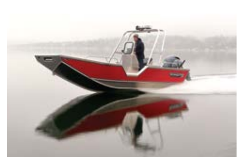
20' Skagit shown with agency options* *All boats pictured contain optional equipment

Wooldridge Boats exclusive jet tunnel offers the best in shallow water running and handling in challenging river running conditions. The tunnel allows the jet foot to be raised for protection, a clean water feed and ram effect. It also provides traction for controlled and predictable performance in tight quarters.