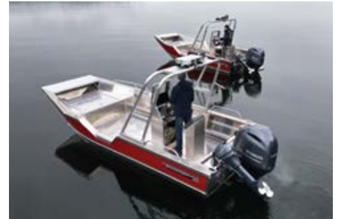
20' and 18' Skagit shown with agency options*