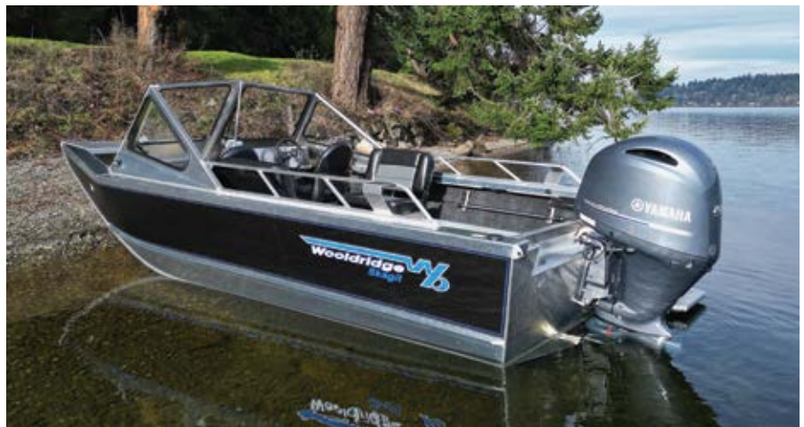
20' Skagit Windshield