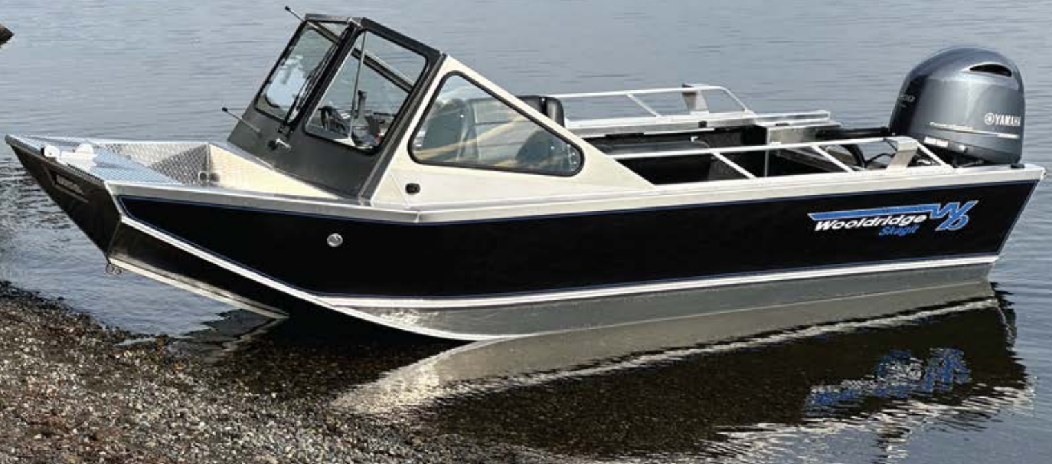
20' Skagit shown with agency options