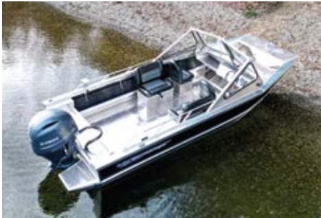
20' Skagit Windshield*