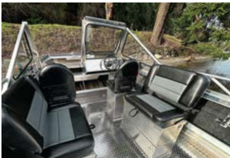
20' Skagit Windshield*