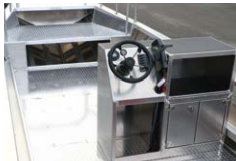
20' Skagit Center Console*