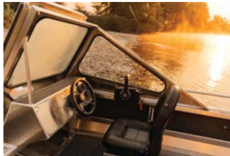
18' Alaskan Windshield shown