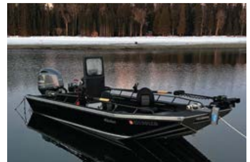
18' Alaskan Center Console shown