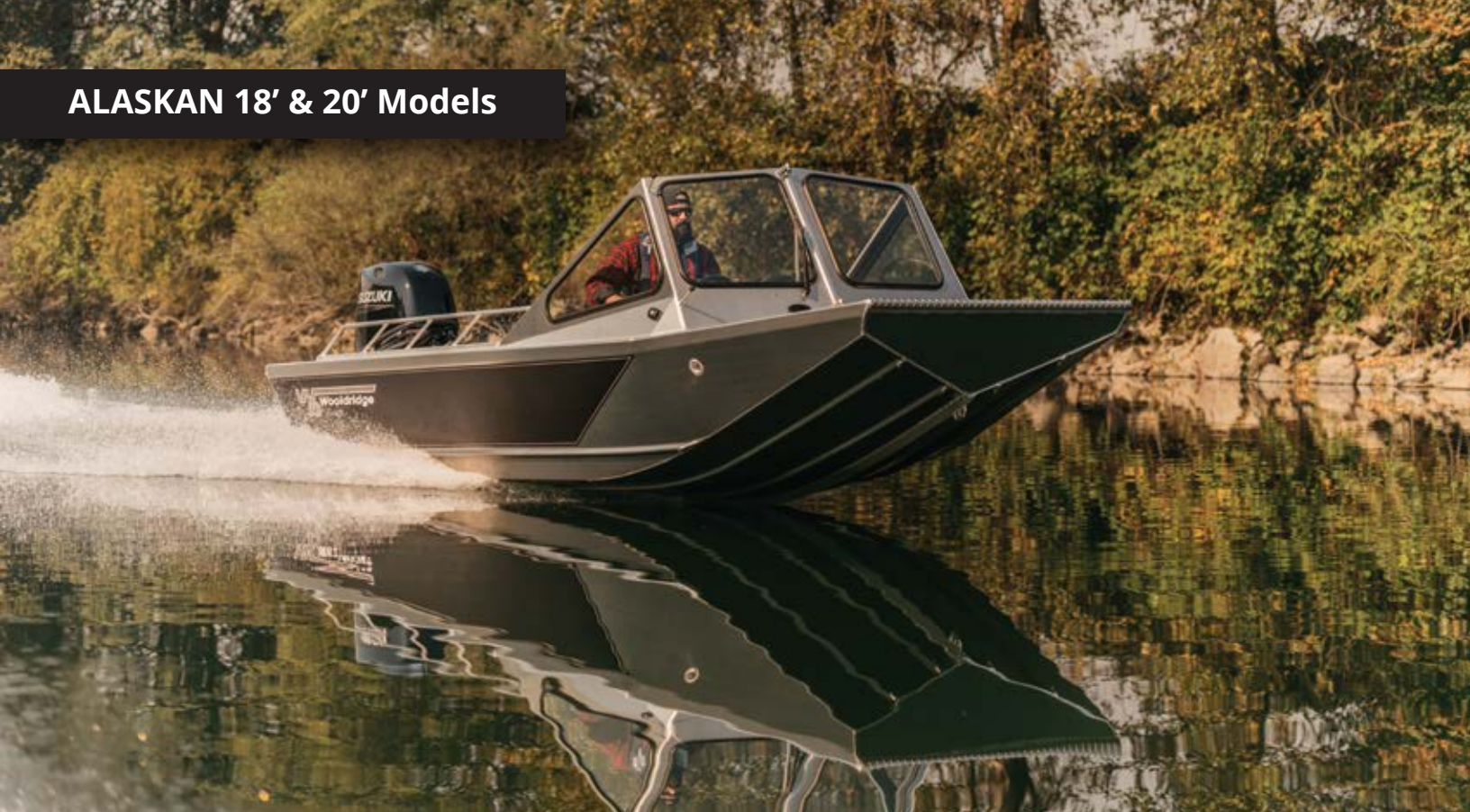
18' Alaskan Windshield shown