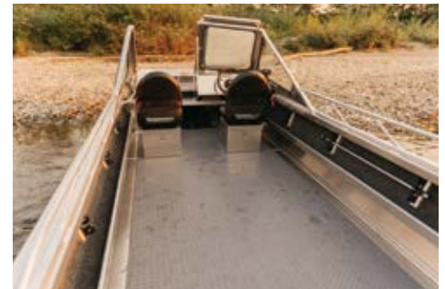
18' Alaskan Windshield shown

Wooldridge Boats exclusive jet tunnel offers the best in shallow water running and handling in challenging river running conditions. The tunnel allows the jet foot to be raised for protection, a clean water feed and ram effect. It also provides traction for controlled and predictable performance in tight quarters.