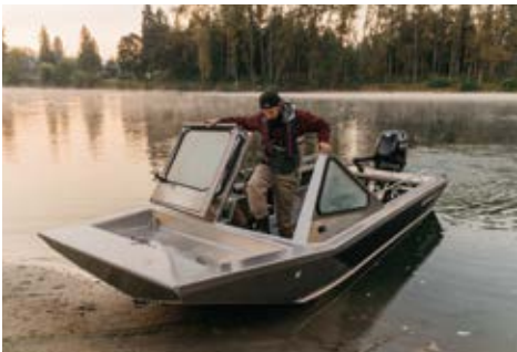
18' Alaskan Windshield shown