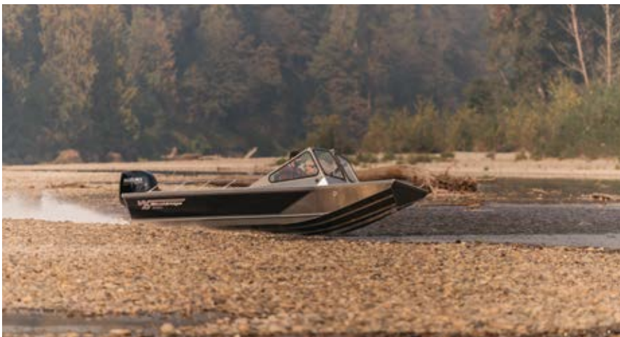
18' Alaskan Windshield shown