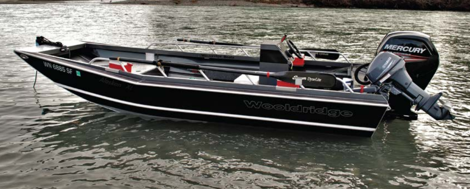
18' Alaskan XL Center Console