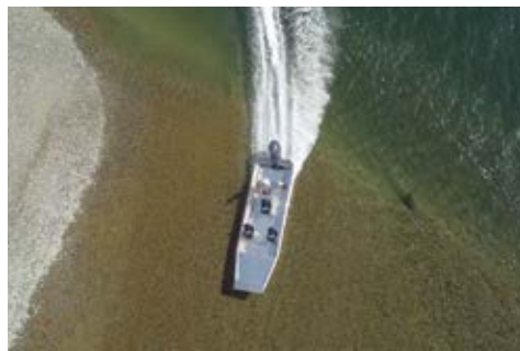
16' Alaskan LT shown with options

Wooldridge Boats exclusive jet tunnel offers the best in shallow water running and handling in challenging river running conditions. The tunnel allows the jet foot to be raised for protection, a clean water feed and ram effect. It also provides traction for controlled and predictable performance in tight quarters.