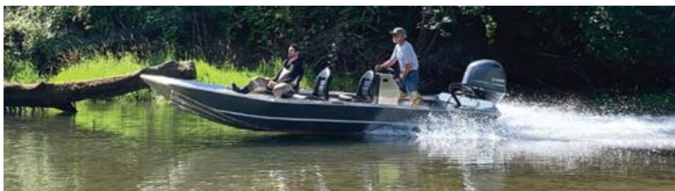
20' Alaskan LT shown with options