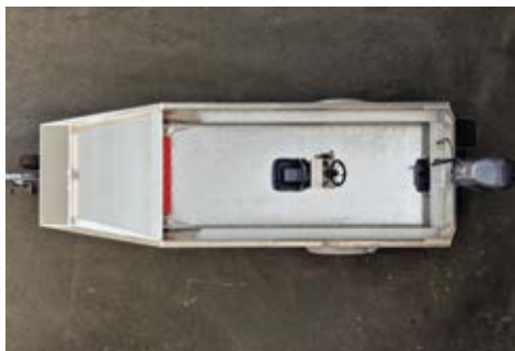
18' Alaskan LT shown with options