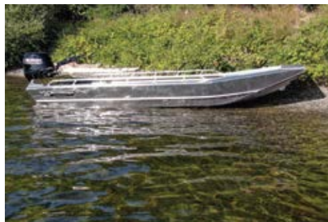
18' Alaskan LT Tiller shown with options