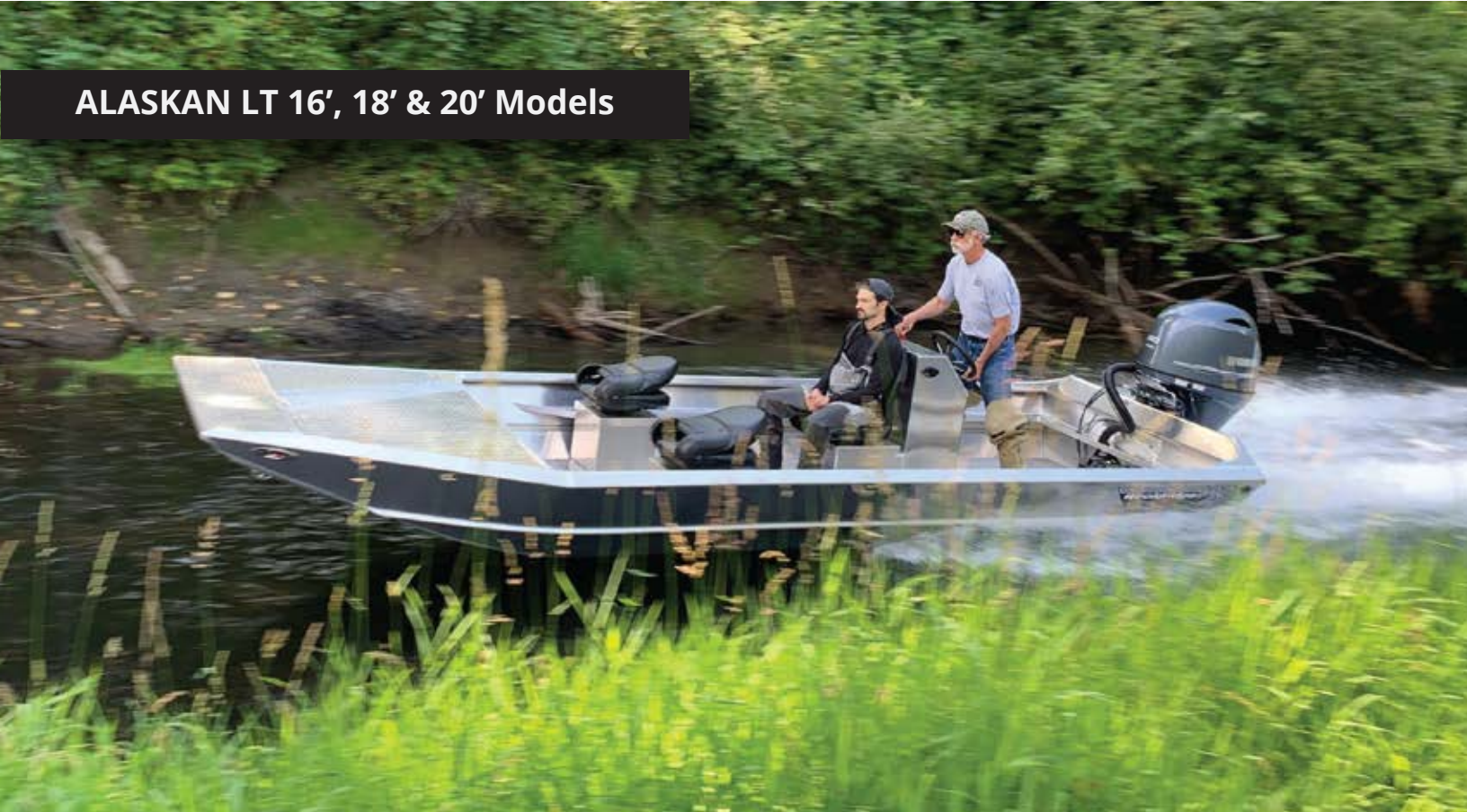
20' Alaskan LT shown with options