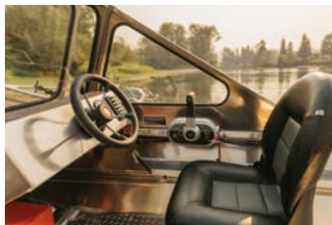
18' Alaskan LT shown with options