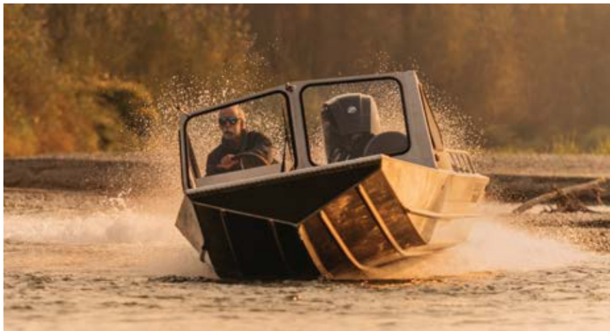
18' Alaskan LT Windshield model shown with options

**Adding windshield option adds approximately 200lbs to boat weight