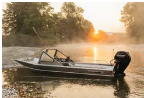
18' Alaskan LT Windshield shown