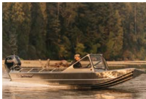
18' Alaskan LT Windshield shown with options