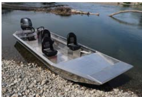
20' Alaskan LT shown with options