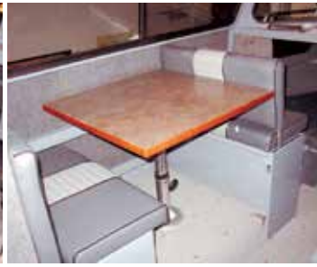
Dinette with front seat switched for cruising