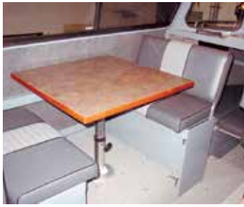
Spacious four-person dinette ready for dinner