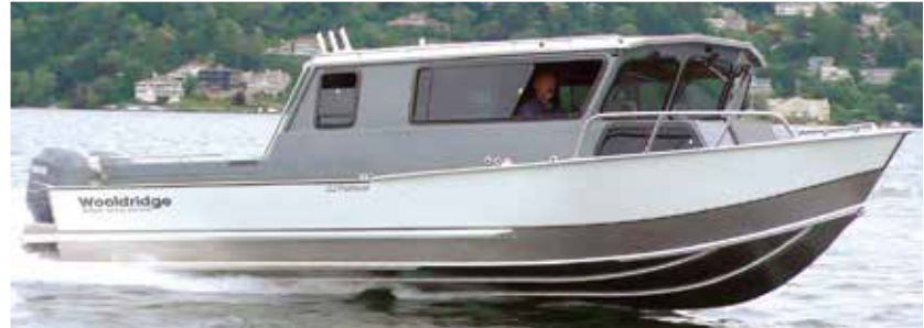
29' SS Pilothouse is fast, fuel efficient and a smooth ride