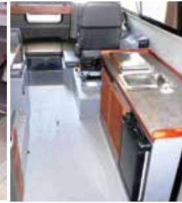
Fully-equipped galley (left). Private stand-up marine head (right)