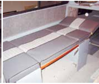
Dinette ready for bed - 7 1/2' bed