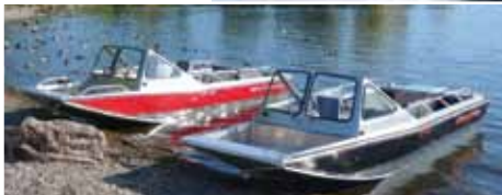
20-foot Sedans, Inboard Jet & Sportjet

to add a measure of strength, impact resistance and slipperiness to the hull. Sometimes impact is unavoidable and this new system is aimed to lessen impact consequences and damage."