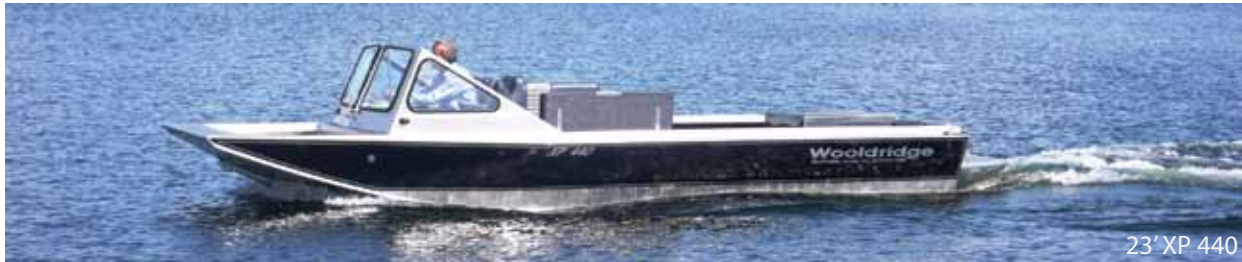
23' XP 440

Built tough and ready to run shallows, there are many options available in Wooldridge XP.