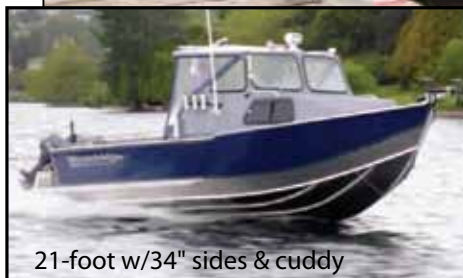
21-foot w/34" sides & cuddy

Select SS Offshore as sedan, sedan with partial hardtop, cuddy and hard cabin with large two-piece walk-thru windshield.