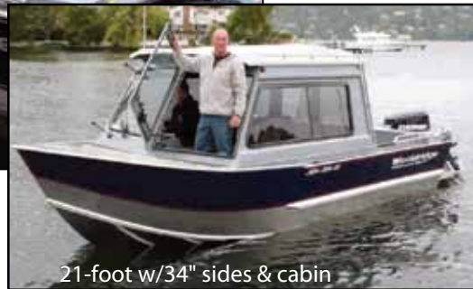
21-foot w/34" sides & cabin

Select SS Offshore as sedan, sedan with partial hardtop, cuddy and hard cabin with large two-piece walk-thru windshield.