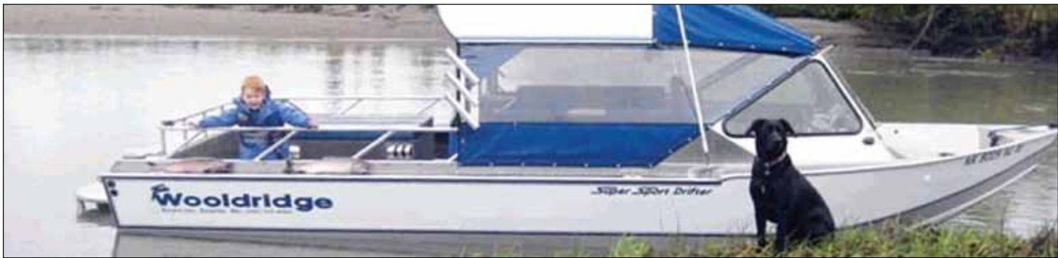
It doesn't get any better than this, a boy, his fish, his dog and the family's Wooldridge 23' Super Sport Drifter Inboard Jet Boat