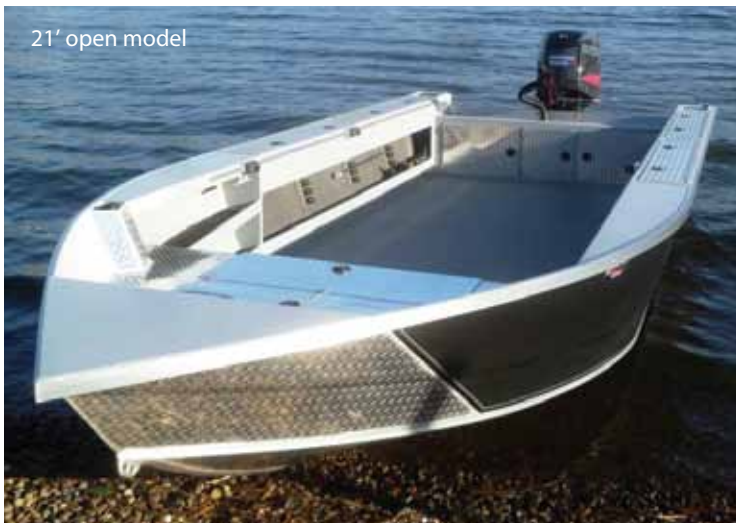
21' open model