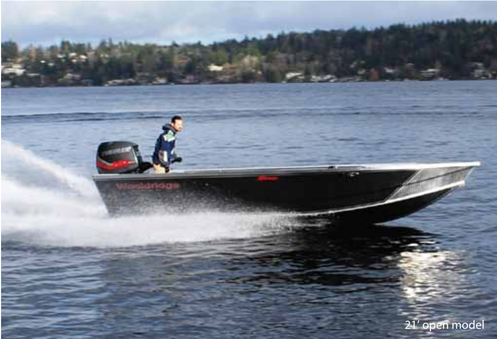
21' open model

The Sportster is a professional guide and avid fisherman inspired boat with plenty of freeboard, a 12° deadrise through the planning surface and 18° deadrise in the bow. The 88" bottom puts lots of hull in the water for hauling a heavy load and getting up on step in a heartbeat. The super-wide bottom adds great stability while fishing and the exclusive Wooldridge jet tunnel assures super shallow water running with aggressive cornering and handling.