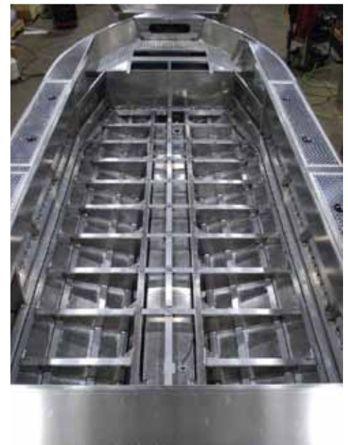
Internal hull structure

The built-in under-floor 52 gallon fuel tank gives excellent range. The Sportster is ready for all-weather fishing with your buddies or recreational boating with the family. There's plenty of elbow room for everyone to have more fun and success on the water!