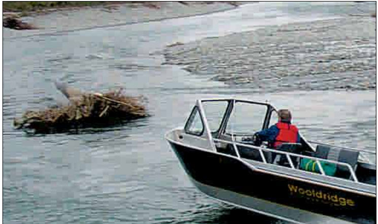
Easy Access through two-piece, walk-thru windshield, hard-charging Sport looks forward to shallow, twisting waterways Sport with Mercury 200hp Optimax Sportjet