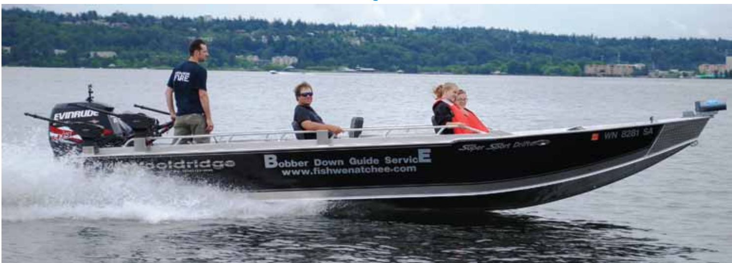
The big beamy Wooldridge Super Sport Drifter outboard runs super shallow and easily maneuvers through obstacle laden waters.