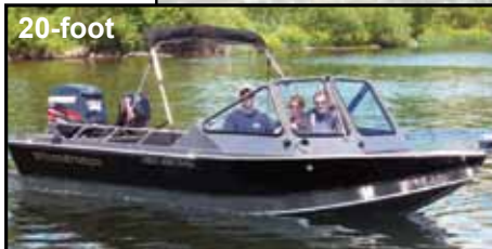
Wooldridge SS Drifter Outboard serves sportsmen in lengths of 20', 23' and 25', sedan or open boat (console or tiller). Wide bottom, high sides and exclusive Wooldridge jet tunnel are standard.